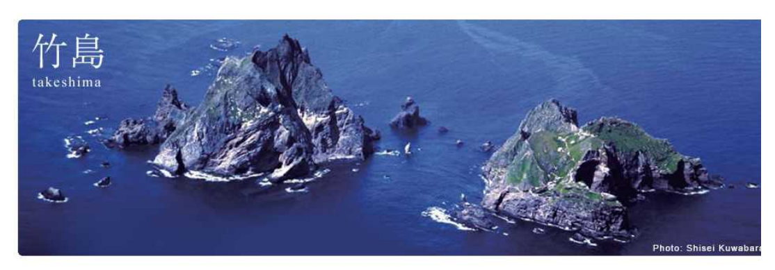
English वर्ण 中文繁体 中文籍体 Français Deutsch Italiano 한국어 Português Русский Español 日本語