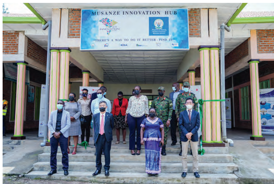
Official group photo during the launch of the Musanze Innovation hub in Musanze district on January 26, 2022.